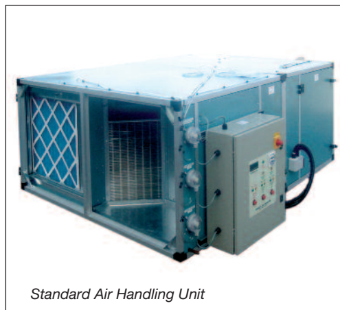
Standard Air Handling Unit