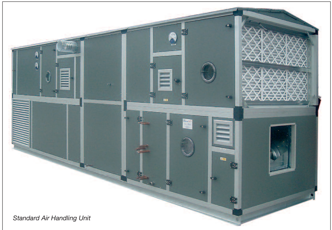
Standard Air Handling Unit