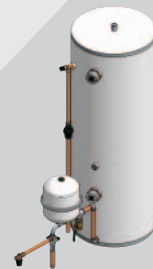
Flamco direct and indirect water heaters and storage vessels