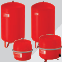
Flexcon expansion vessels and sealed system equipment