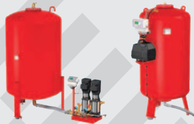
Flamcomat and Flexcon M-K pressurisation units