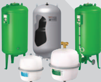
Airfix potable water expansion vessels