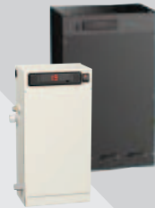
Flexcon pressurisation and sealed system units